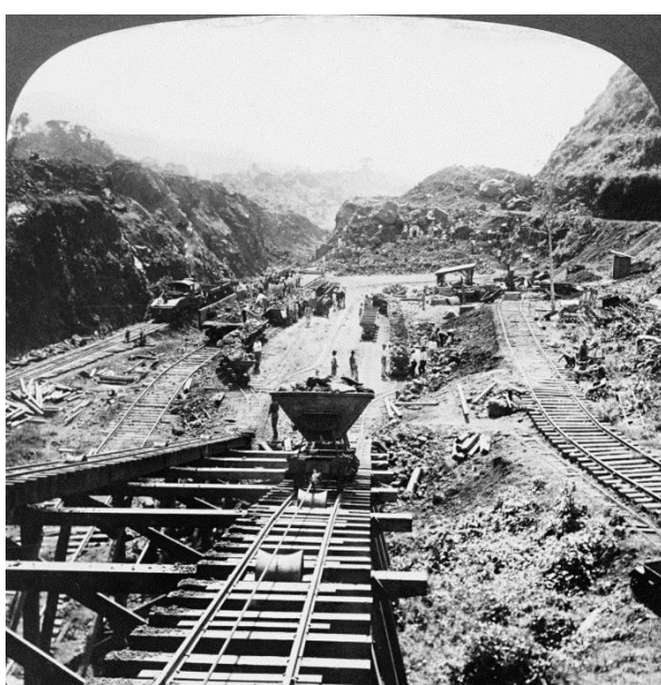
Above: The construction of the Panama Canal.