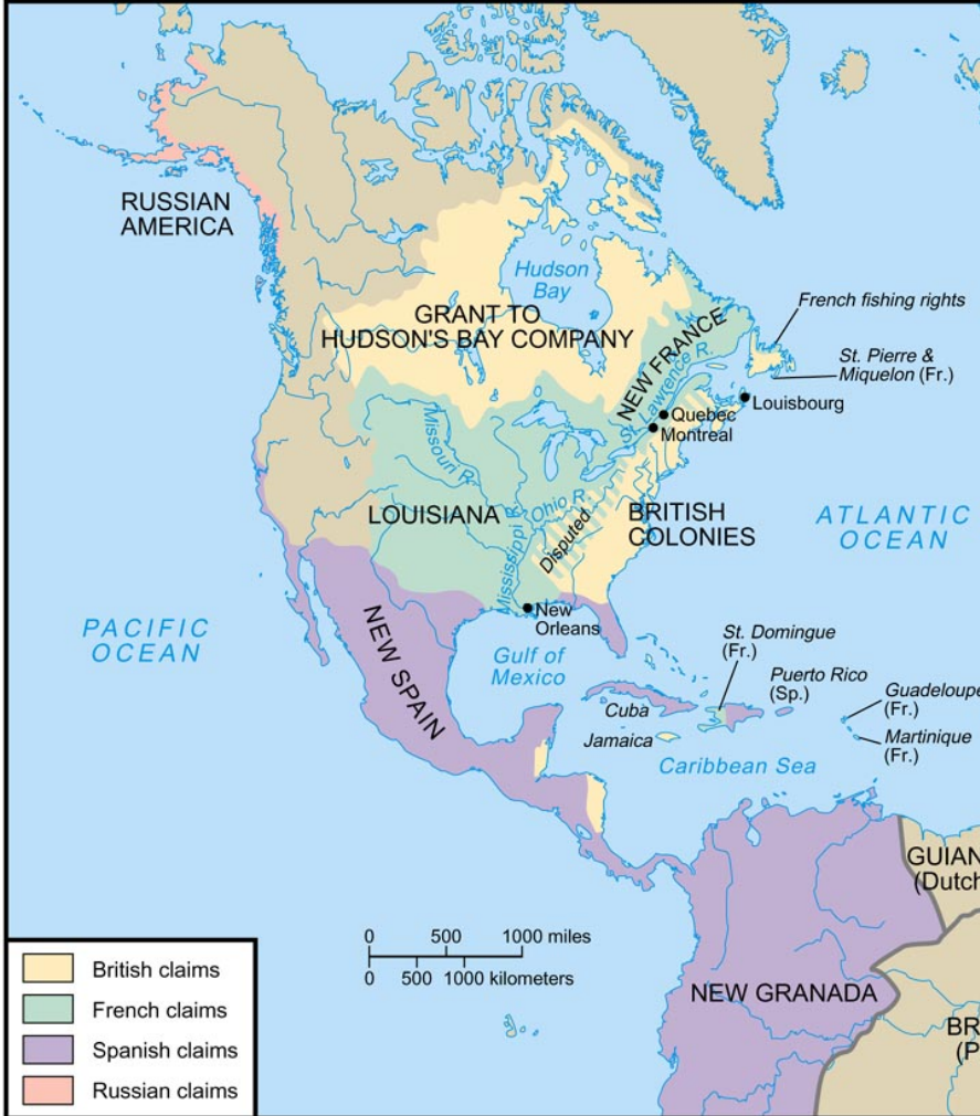
NORTH AMERICA, 1750