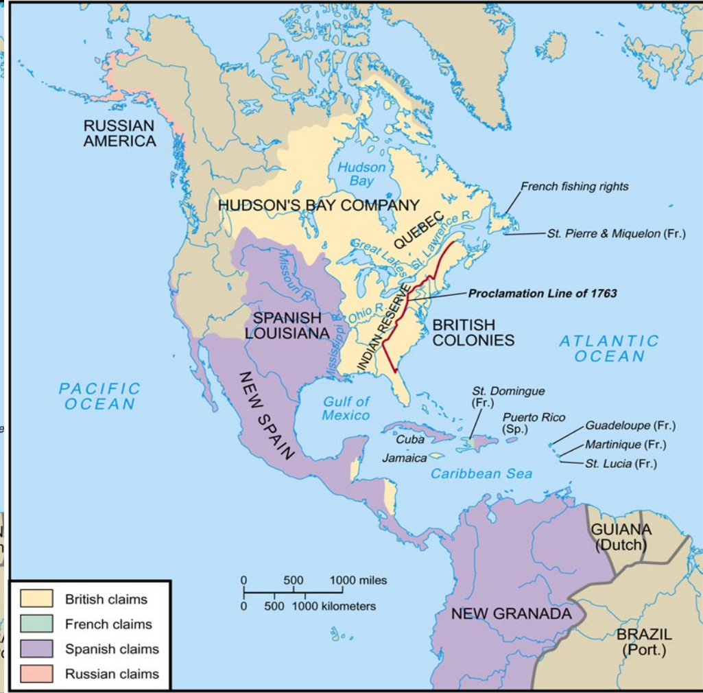
NORTH AMERICA AFTER 1763

The war lasted from 1754-1763 and will have a dramatic impact on the relationship between the colonies and England