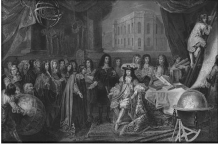
Element B: Identify the major ideas of the Enlightenment from the writings of Locke, Voltaire, and Rousseau, and their relationship to politics and society

SSWH13: Examine the intellectual, political, social, and economic factors that changed the European worldview from the 16 th century to the late 18 th century