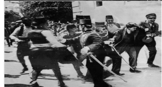
Capture of Black Hand assassin of Archduke Franz Ferdinand, Sarajevo, 28 Jun 1914