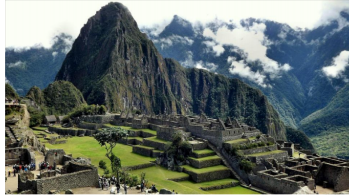
Machu Picchu's history is a matter of debate but some historians believe that it was the royal estate of Wiragocho Inka.