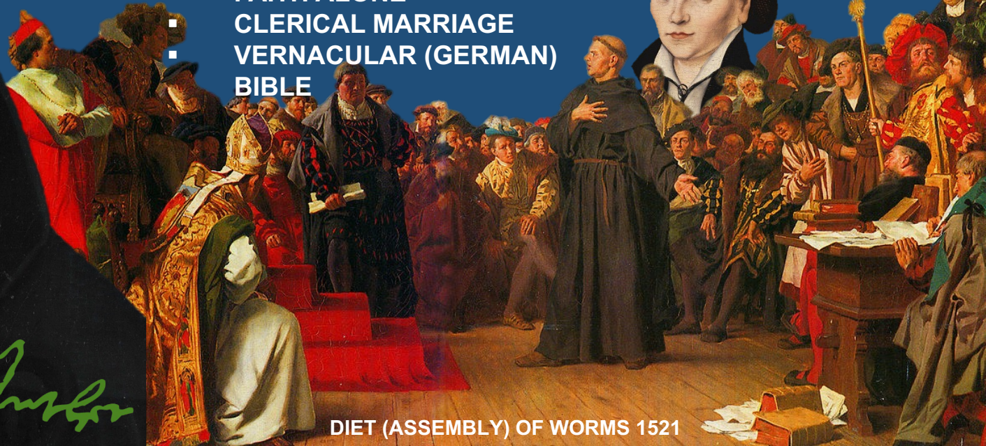
DIET (ASSEMBLY) OF WORMS 1521