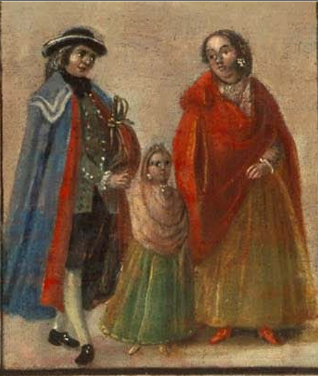
Castizo con Española Español.