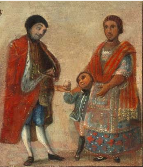
Español con India, Mestizo.