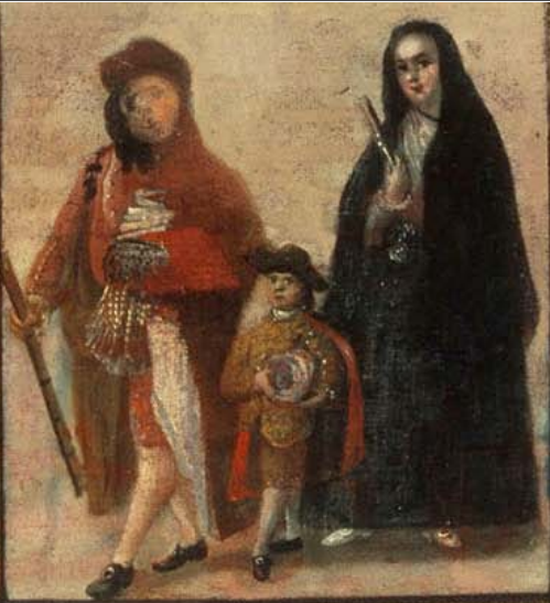
Mestizo con Española Castizo.