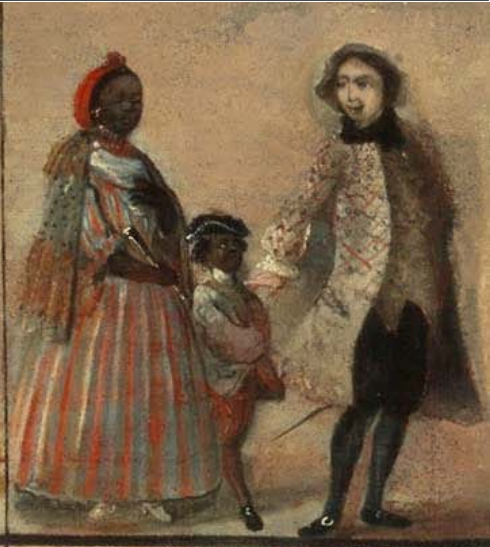
Español con Mora Mulato.