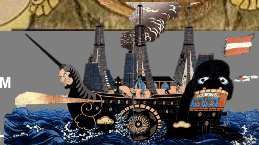
MISSISSIPPI, ONE OF THE FOUR NAVAL GUNSHIPS