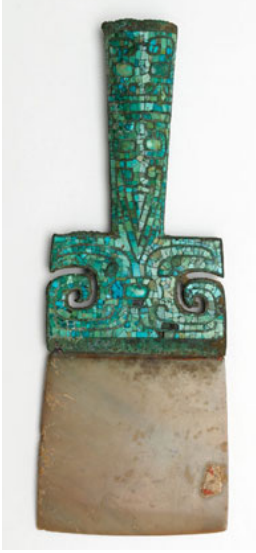
Ceremonial Bronze Chisel with Jade Inlay, Shang

Question 2: Answer all parts of the question that follows: