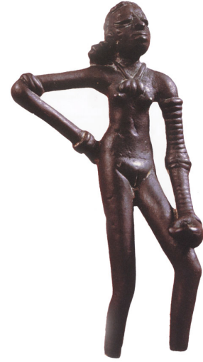
Dancing Girl, Harappa